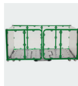
Low Position of 100mm