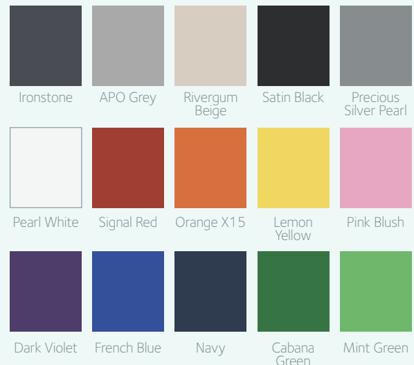
Colour 1 Bed base and End panels