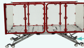
Colour 2 Doors / Sides

Use this guide when choosing your 2 powdercoat colours. Custom options available