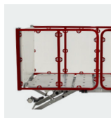
Transparent Perspex Inserts